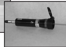
SpeedVue Laser Speed Sensor (close-up)

The SpeedVue Model 430 Laser Speed Sensor (part number A0430LS) offers a ground-breaking new technology for the measurement of turning speed on rotating equipment. It uses a laser beam, in conjunction with an advanced signal processing algorithm to measure turning speed without requiring any special markings on the shaft. Readings are typically possible from up to 30 ft. away without reflective tape, or up to 100 ft. away with reflective tape. SpeedVue is intended for use with the Model 2120A and Model 2130. The user connects the