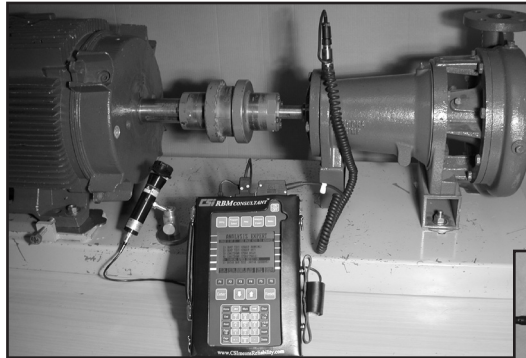
SpeedVue Laser Speed Sensor as used with Model 2120A RBMconsultant

* when used with CSI Model 2120A and 2130 analyzers